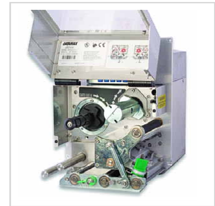
Right-hand Model, Cover Open