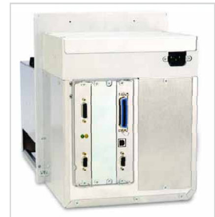
Rear of Printer, Slide in Card Cage